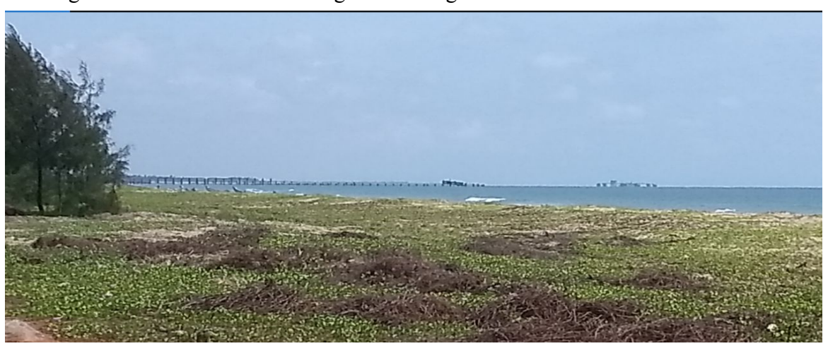
(Image: Jetty like structure of chemplast sanmar and Allied silica ltd)

The team had a look on the abandoned port of <u>Nagarjuna oil refinery</u>. The refinery was said to be destroyed by the Thane cyclone. From a few kilometers distance into the sea, the Island Jetty for boat landing is provided for <u>Chemplast sanmar</u> and <u>Marine Terminal Facility (MTF)</u> for import of Vinyl Chloride monomer is present there. According to the local activistes, <u>Allied Silica Ltd</u> is also using the same MTF for unloading and loading of chemicals.